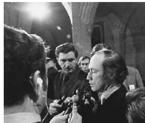
Prime Minister Pierre Trudeau mobbed by press after War Measures Act announcement.

Measures Act — the only time it has been applied during peacetime in Canadian history.