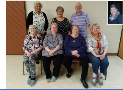
Current Board Members