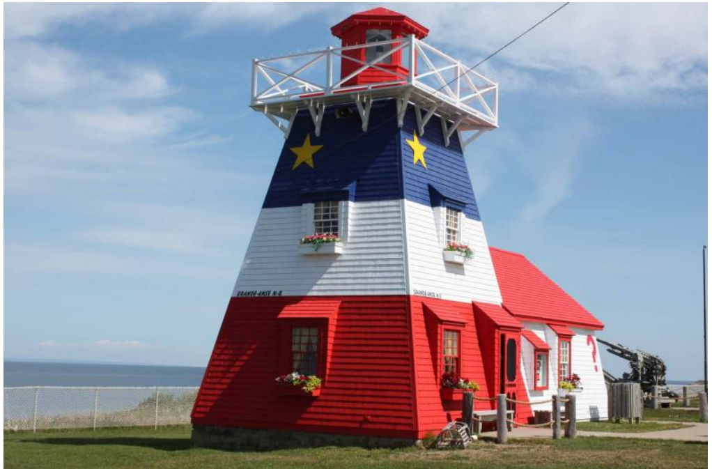
Acadian Coastal Drive - Village of Grande-Anse, New Brunswick

The Acadian people, pioneers, and builders of the country have celebrated Acadian Day on August 15 since 1881, the year in which the first national Acadian convention was held in Memramcook, New Brunswick. The National Acadian Day Act was passed by the Government of Canada in 2003.