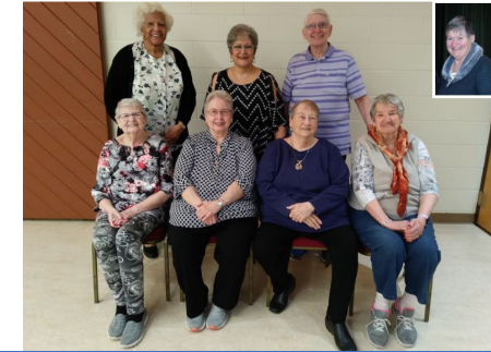
Current Board Members