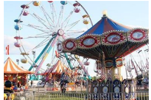
Brampton Fall Fair is so much fun!